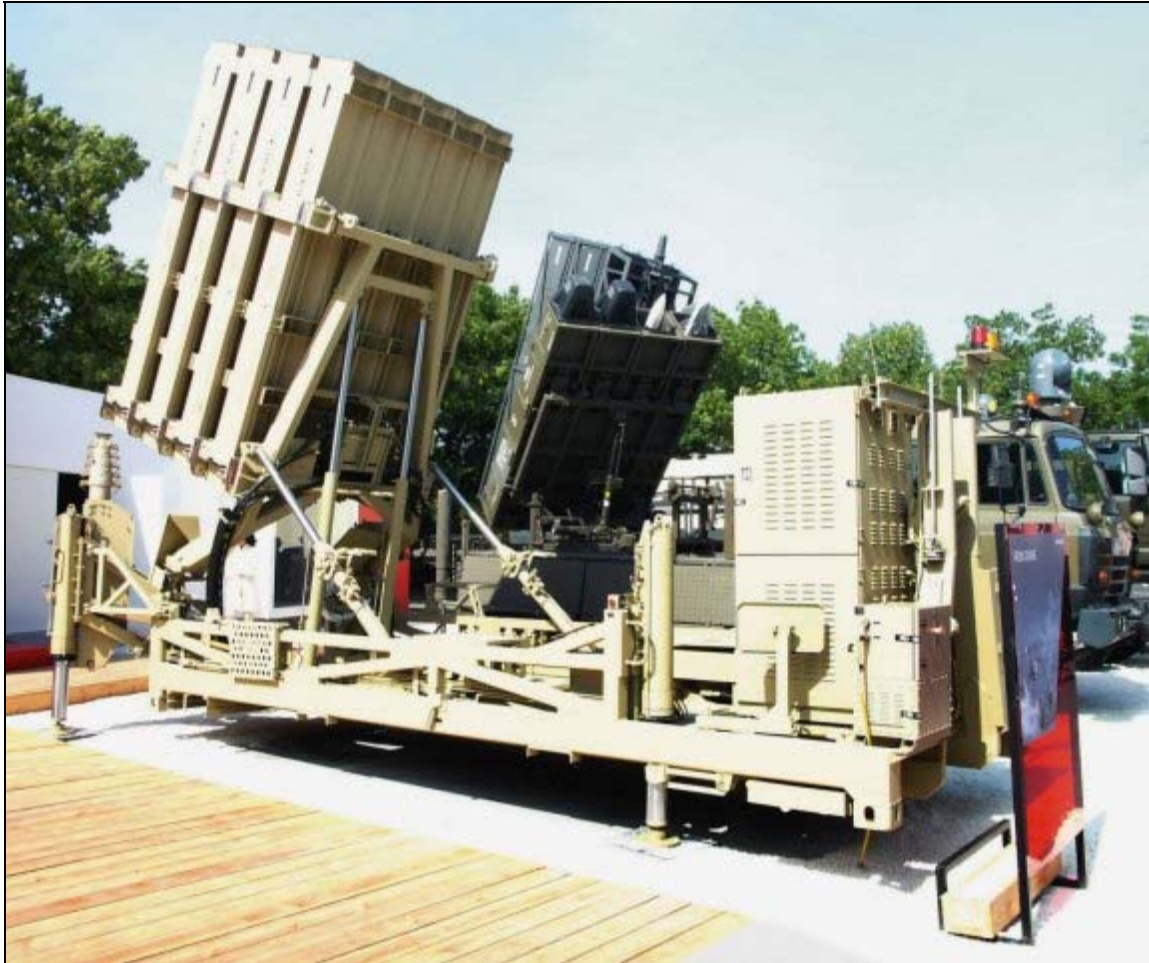
Figure 2. Iron Dome Battery